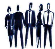
Annual Congregational Meeting

.A benefit of a local church is that it provides you with the spiritual protection of Godly leaders. God gives shepherd leaders the responsibility to guard, protect, defend and care for the spiritual welfare of his flock. We are told, "Their work is to watch over your souls, and they know they are accountable to God" (Hebrews 13:17, NLT).